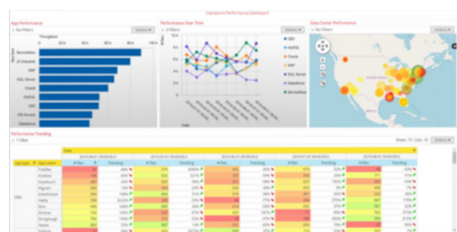
Figure 2. Real-time self-service capabilities and built-in data modeling