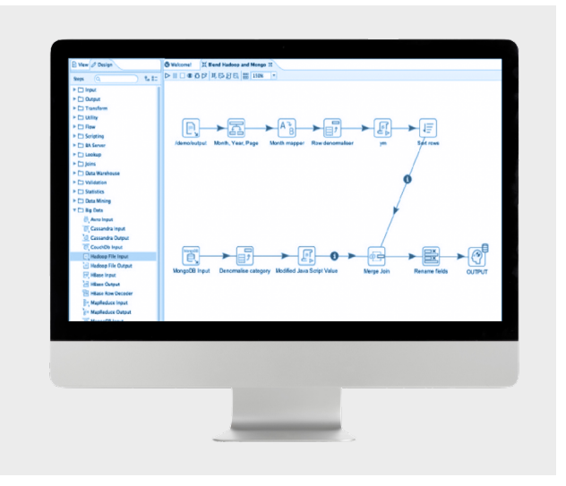
Fig. 2 Drag-and-drop data transformation in Pentaho Data Integration