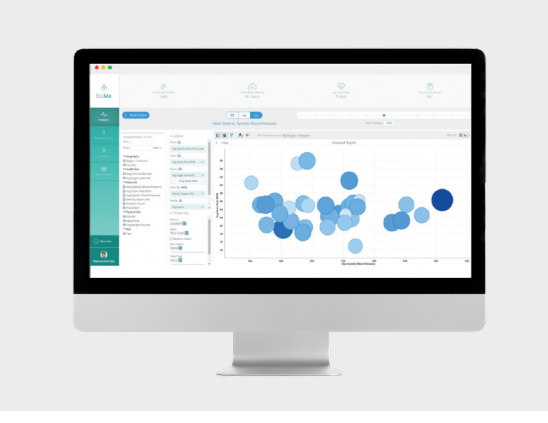
Fig. 6 Pentaho Analytics capability embedded into a web application