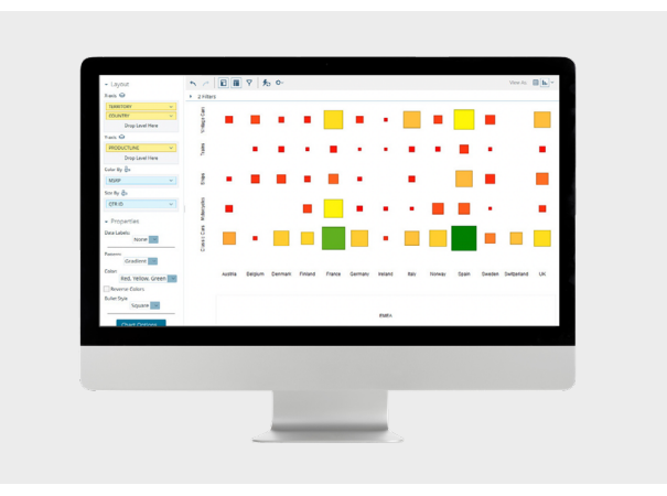
Fig. 4 Heat grid analysis in Pentaho Business Analytics

Extend the benefits of the open, extensible Pentaho technology to address a wide range of needs in multi, hybrid and private cloud deployments. Modern Pentaho data architecture simplifies management of your increasingly distributed data architecture with a single data management tool.