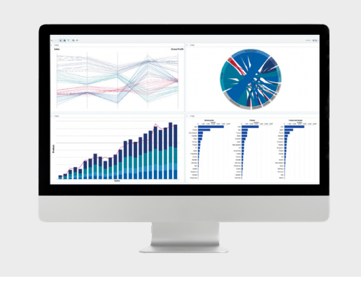
Fig. 5 Intuitive dashboard in Pentaho Business Analytics